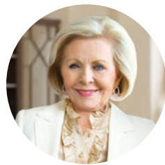
by Gloria Copeland