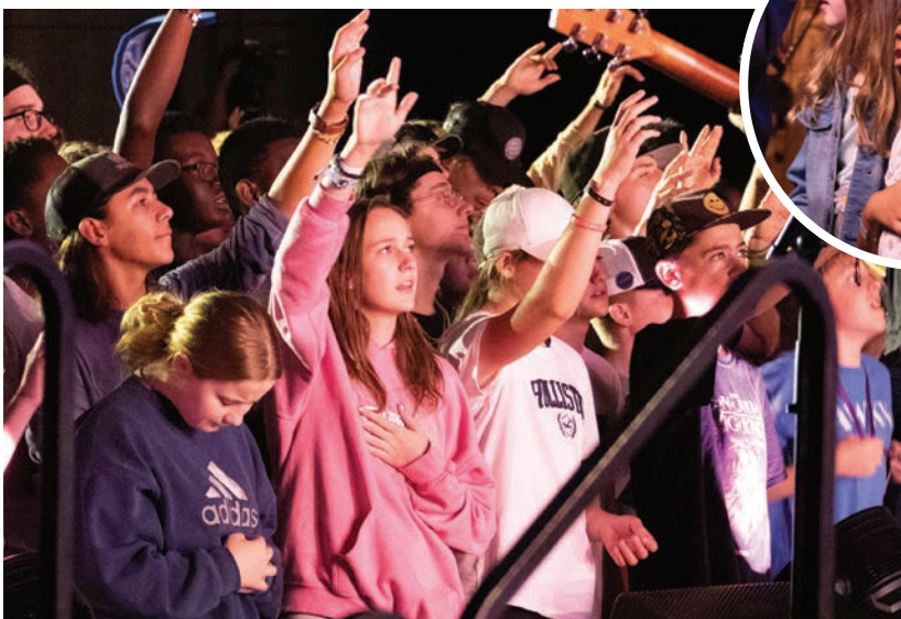
14forty youth services at Southwest Believers' Convention and Superkid Academy (inset)

God moved once again during EMIC's annual Miracles on the Mountain meeting. This popular event welcomed more than 750