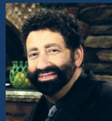
Rabbi Jonathan Cahn